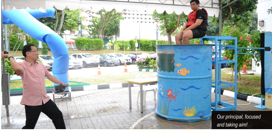
MEGA EVENT DAY EXTRAVAGANZA PART ONE: