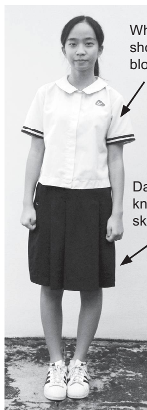
White colour short sleeved blouse